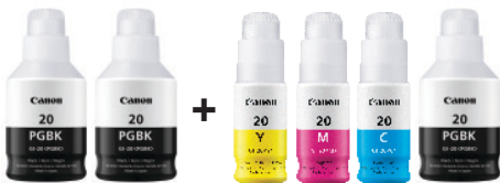
INCLUDED INK BOTTLES